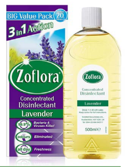
Thornton & Ross product Zoflora disinfectant

Thornton & Ross' impressive list of household trade names includes the UK's leading disinfectant Zoflora along with cough medicine Covonia, Cetraben cream for dry, sensitive or eczema-prone skin and Hedrin which gets rid of head lice.